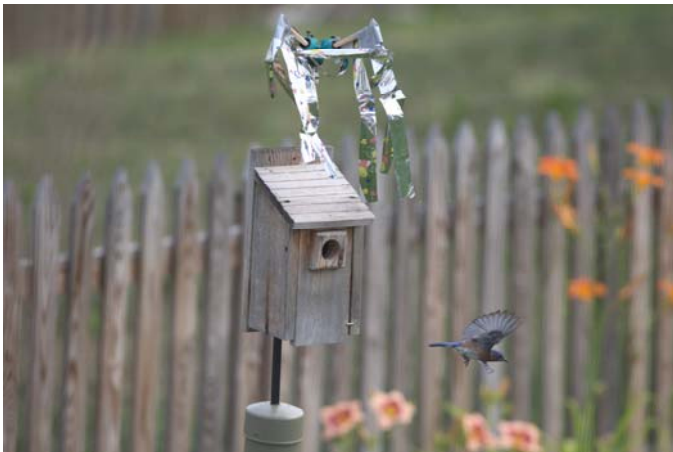
A bove: Homemade Sparrow Spooker Photos courtesy of Dave Kinneer

This non-native bird must not be allowed to nest. House Sparrow graphics courtesy of Cornell Laboratory of Ornithology / Home Study Course